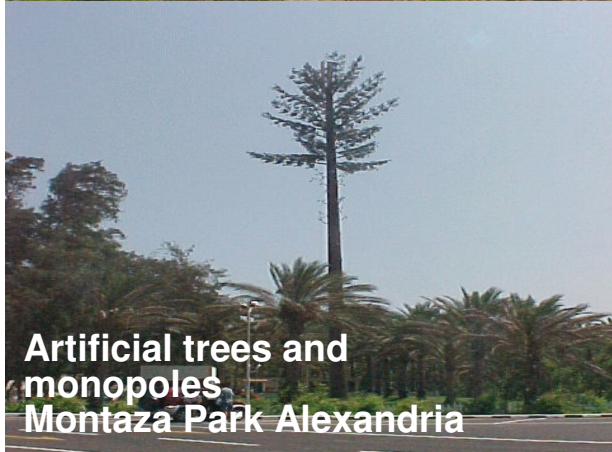
Artificial trees and monopoles Montaza Park Alexandria