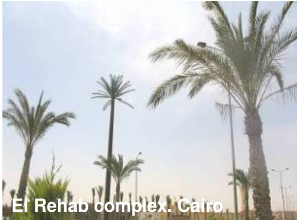
El Rehab complex. Cairo